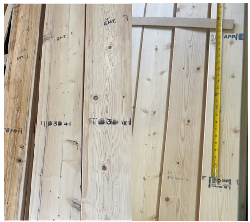
Figure 1 — shows examples of marking grade nomenclature in the applicable accredited agency's rule book even though the boards are not being graded according to the grade designation. The stamped information 3 and APP label are present on lumber when not being graded according to 3 or APP rule.

Situation: A request has been made to further clarify what information included on ALSC-stamped products by an ALSC accredited agencies subscriber would be considered a confusing or deceptive marking. Note that in general products are permitted to be stamped with marketing and other language provided that such other information is at least six inches from the grade-stamp and such other information is not confusingly or deceptively similar to the grademarks of an ALSC-accredited agency. ALSC staff has observed several examples of labels located greater than 6 inches from the grade stamp which may be considered confusingly or deceptively similar to ALSC-accredited agency grademarks (Figures 1-3).