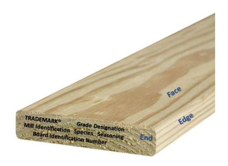
Illustration of End labeling of lumber

ALSC Ratified Staff Responses Page 16 November 1, 2024