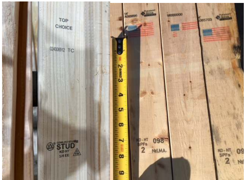
Figure 2 — Labels using terms that are clearly non-ALSC terms like "Top Choice" and a reproduction of the American flag.