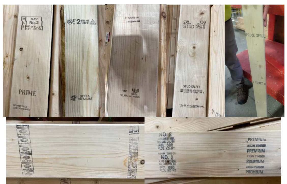
Figure 3 – Shows several examples that illustrate use of ALSC grade terms "Prime", "Premium", "Select", or species on lumber even though these terms may not be in the particular agency's rule book.

ALSC staff response: ALSC staff will object if there is wording or symbols that reflect the species, grade name, moisture content, or phytosanitary treatment on a product (the "Product Marking") that is included in the book of the rules-writing agency under